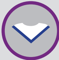
LITERACY AND ADULT EDUCATION