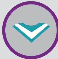
SCHOOL OF BUSINESS