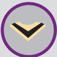
SCHOOL OF MINING, ENERGY AND MANUFACTURING