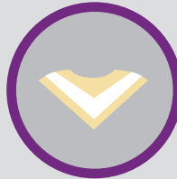
SCHOOL OF NURSING