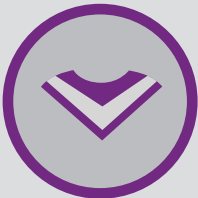
SASK POLYTECH GENERAL

Along with the academic tradition of black gowns, Saskatchewan Polytechnic grads wear v-stoles in the colour selected for each school. Other members of the platform procession wear the gown and v-stole, hood, or in some instances, a hat or mortarboard representing a credential they have received or the Saskatchewan Polytechnic v-stole that represents the school in which they teach.