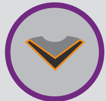
SCHOOL OF INFORMATION AND COMMUNICATIONS TECHNOLOGY