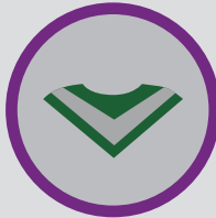
SCHOOL OF NATURAL RESOURCES AND BUILT ENVIRONMENT