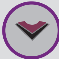
SCHOOL OF HUMAN SERVICES AND COMMUNITY SAFETY