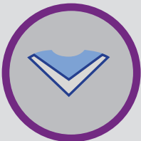
SCHOOL OF HEALTH SCIENCES