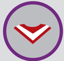
SCHOOL OF CONSTRUCTION