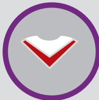
SCHOOL OF HOSPITALITY AND TOURISM