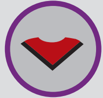
SCHOOL OF TRANSPORTATION