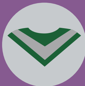
School of Natural Resources and Built Environment hunter green with silver trim