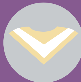
School of Nursing gold with white trim