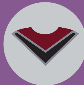
School of Human Services and Community Safety maroon with grey and black trim