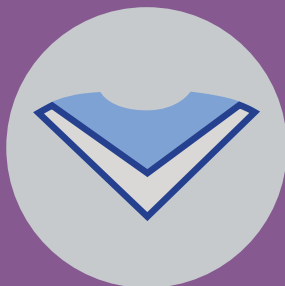
School of Health Sciences blue with navy and silver trim