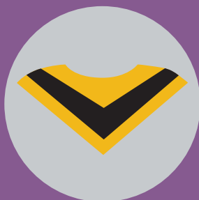
School of Mining, Energy and Manufacturing copper with black trim