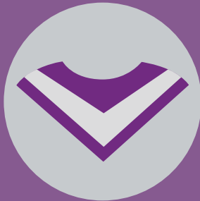
Sask Polytech General purple with silver trim

Along with the academic tradition of black gowns, Saskatchewan Polytechnic grads wear v-stoles in the colour selected for each school. Other members of the platform procession wear the gown and v-stole, hood, or in some instances, a hat or mortarboard representing a credential they have received or the Saskatchewan Polytechnic v-stole that represents the school in which they teach.