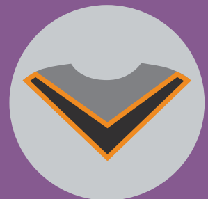
School of Information and Communications Technology silver with black and orange trim