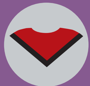
School of Transportation red with black trim