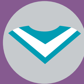
School of Business teal with white trim