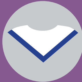
Literacy and Adult Education white with royal blue trim