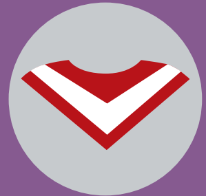
Joseph A. Remai School of Construction red with white trim