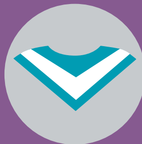
School of Business teal with white trim