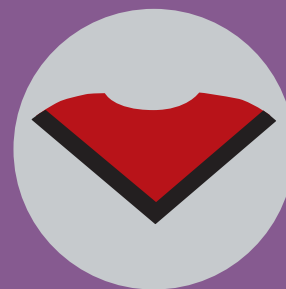
School of Transportation red with black trim