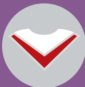
School of Hospitality and Tourism white with grey and red trim