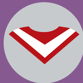
Joseph A. Remai School of Construction red with white trim