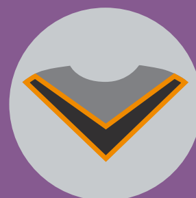
School of Information and Communications Technology silver with black and orange trim