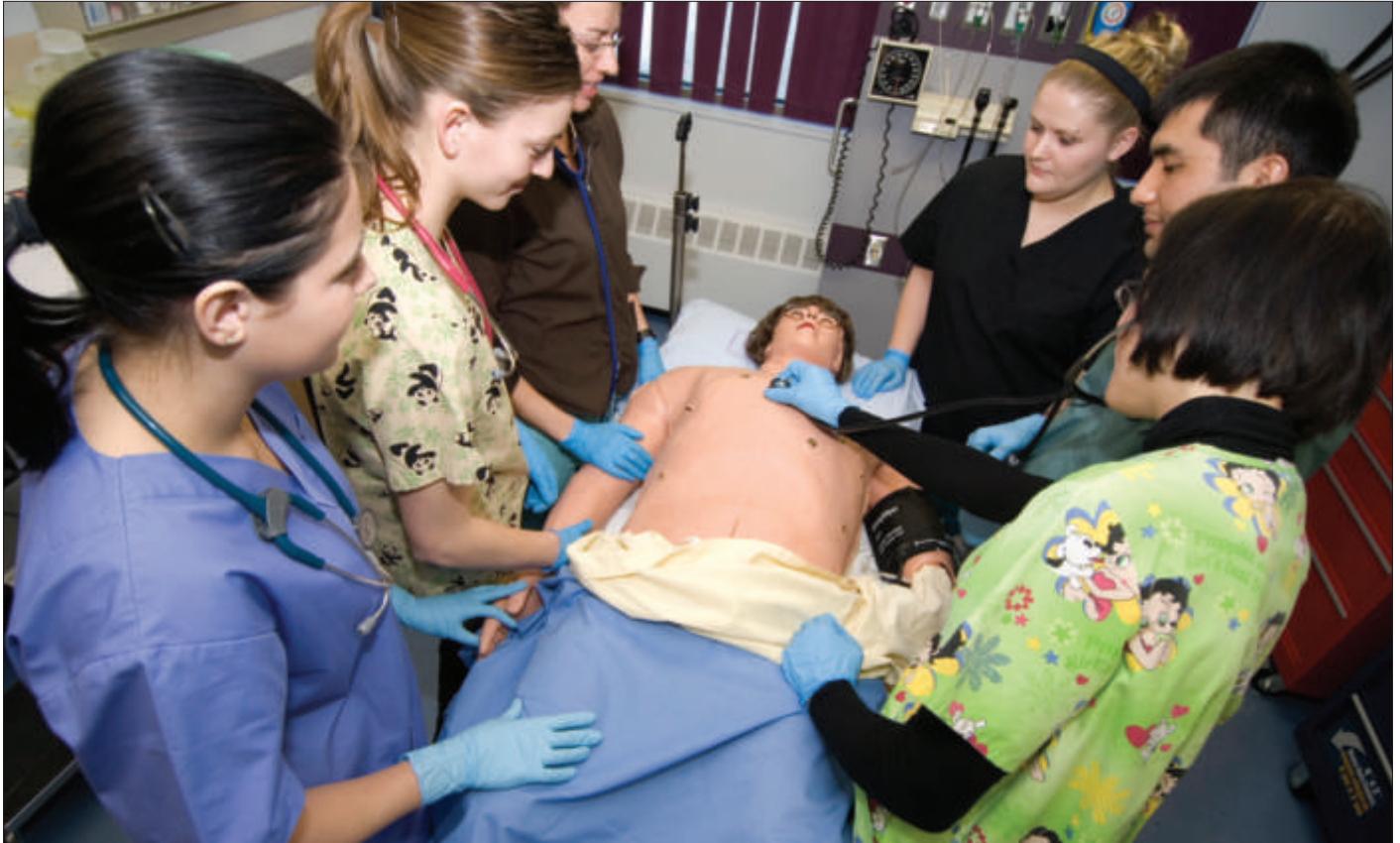
Second-year NEPS students assess their "patient" in one of SIAST's new interprofessional simulation rooms.