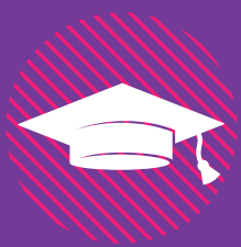
Strength in academic offerings