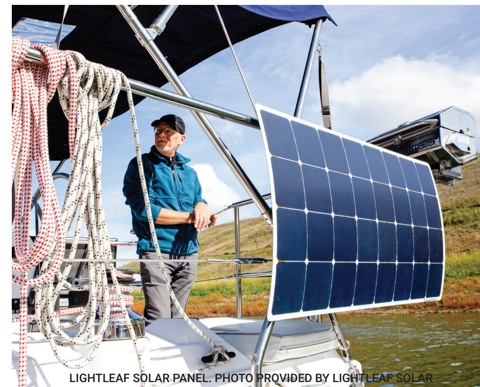
LIGHTLEAF SOLAR PANEL.