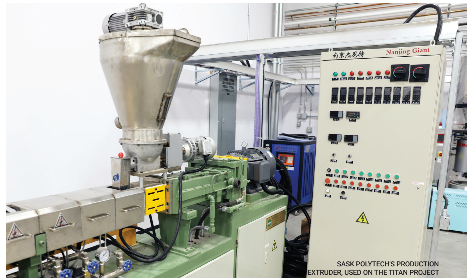
SASK POLYTECH'S PRODUCTION EXTRUDER, USED ON THE TITAN PROJECT

Learn more at saskpolytech.ca/research .