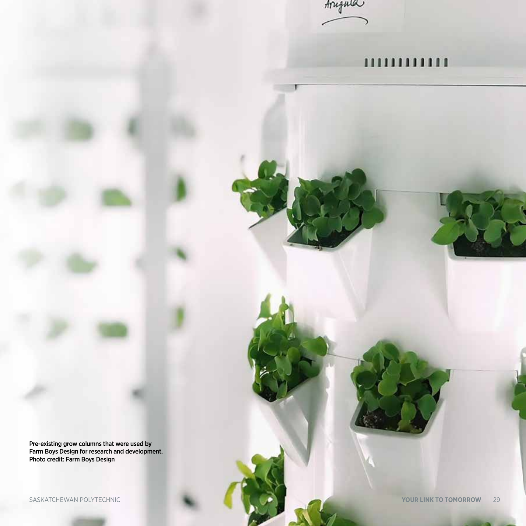
Pre-existing grow columns that were used by Farm Boys Design for research and development.