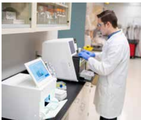
Sequencing is being integrated into multiple training programs and applied research initiatives.

BARC has recently received additional equipment to provide it with capacity to undertake genomic sequencing. Through Western Economic Diversification funding obtained in cooperation with Genome Prairie, BARC has received two next-generation sequencers that will provide Sask Polytech with the capacity to undertake research and data analysis, while training students in sequencing methods and equipment operation. The new equipment will enable a wide variety of applied research applications, allowing investigation of the DNA and RNA of any organism. While they are housed within BARC, it is anticipated that the new sequencers will be used to advance teaching and applied research in multiple programs, including BioScience Technology, Medical Diagnostics, Agriculture and Natural Resource Technology.